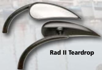
Rad II Teardrop